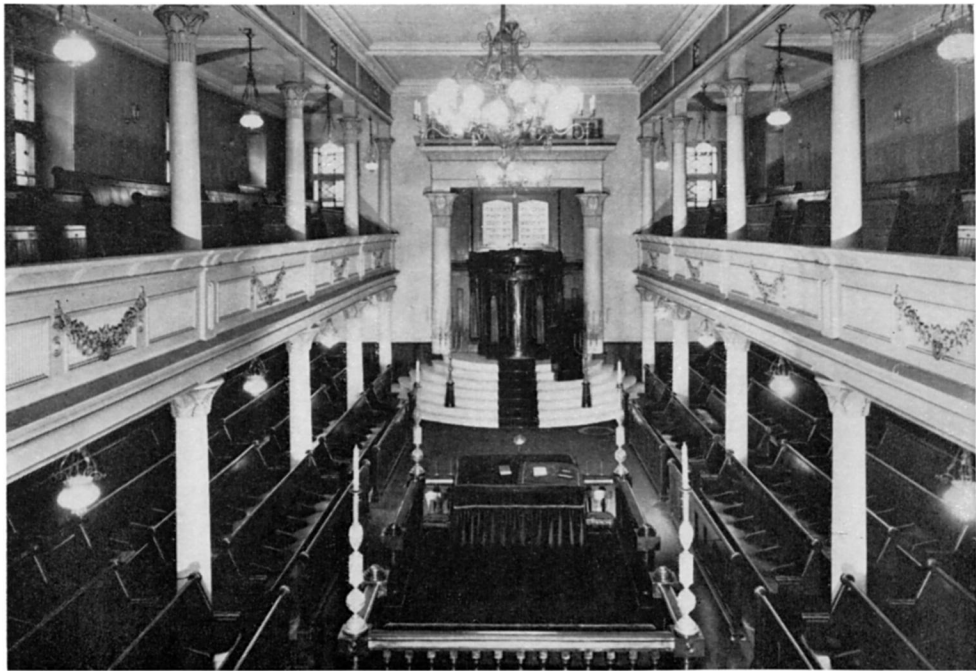
Fig. 5. Interior view of the Spanish and Portuguese Synagogue, Stanley Street, Montreal (1890–1946). The Ark and marble steps leading to it were transferred from former synagogue buildings.