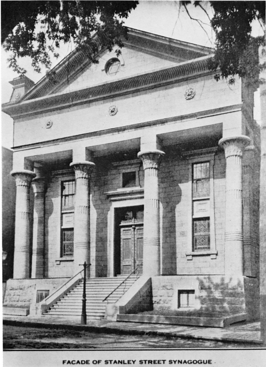
Fig. 1. Exterior of the Stanley Street Synagogue (1890-1946) of the Montreal Spanish and Portuguese congregation